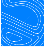
EXHIBIT SKETCH 20' WATER LINE EASEMENT

earthworx, LLC 4300 North Access Road, Suite C Chattanooga, Tennessee 37415